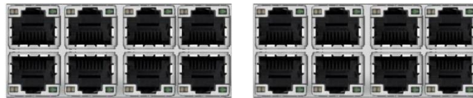
16 x 1 Gbps Ethernet Ports

14 WAN & 2 USB CELLULAR WAN ~2 Gbps Throughput